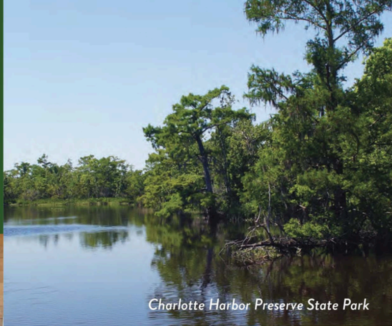
Charlotte Harbor Preserve State Park