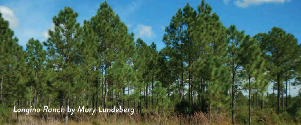
Longino Ranch by Mary Lundeberg

656 ACRES PROTECTED AT LONGINO RANCH BRINGING THE TOTAL CONSERVED LANDS PROTECTING THE WILD & SCENIC MYAKKA RIVER TO OVER 130,000 ACRES