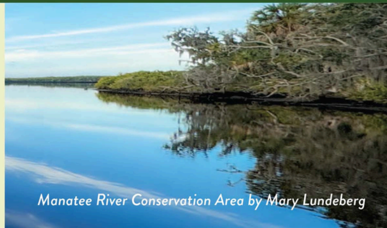
Manatee River Conservation Area

58 ACRES CONSERVED IN SUBURBAN MANATEE COUNTY EXPANDING THE PROTECTED LANDS ALONG GAP CREEK AND SAFEGUARDING WATER QUALITY